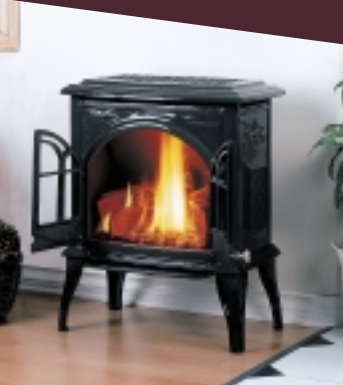
The cast iron freestanding Ascot with Diamond Black porcelain coating