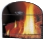
Clip-on fire screen